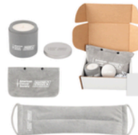
Pamper Me Set