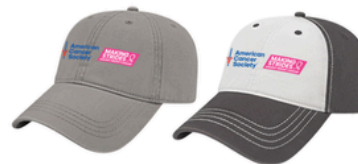
Relaxed Golf Cap