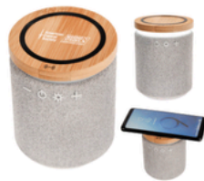
Ultra Sound Speaker & Wireless Charge