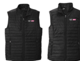
Port Authority® Packable Puffy Vest