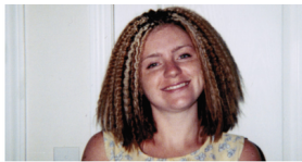
The Emily K. Lauer Memorial Fund