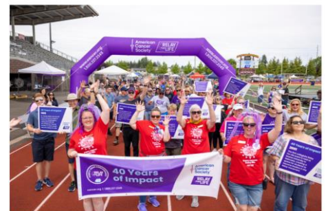
$250 can help 10 people facing breast cancer connect with trained survivors.