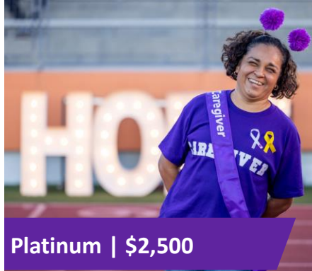
Platinum | $2,500