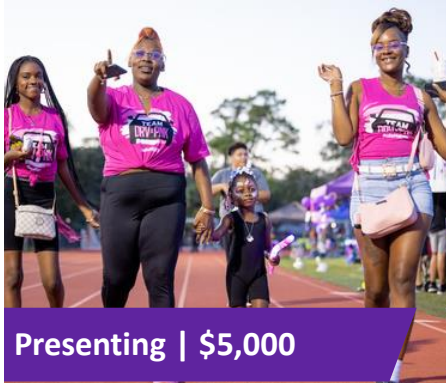
Presenting | $5,000

*Amenities subject to change if event experience needs to change due to circumstances beyond our control