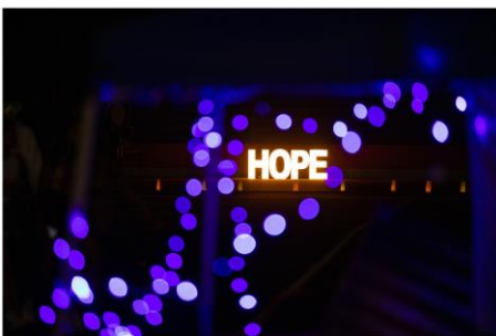
$1000 can help over 100 people find hope and support online.