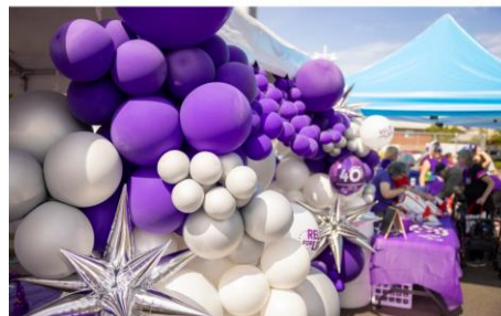
$500 can help 11 people find free answers about cancer with a cancer information specialist.