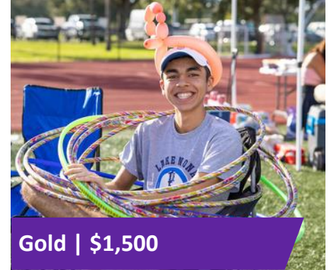
Gold | $1,500