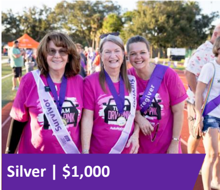
Silver | $1,000

*Amenities subject to change if event experience needs to change due to circumstances beyond our control