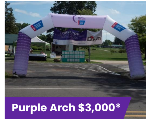
Purple Arch $3,000*