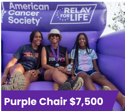
Purple Chair $7,500