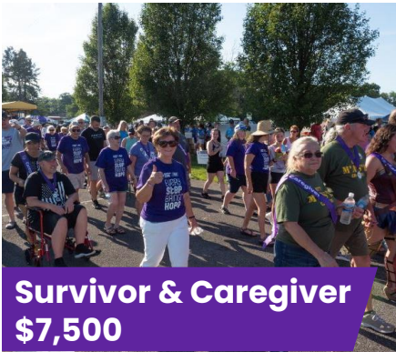
Survivor & Caregiver $7,500