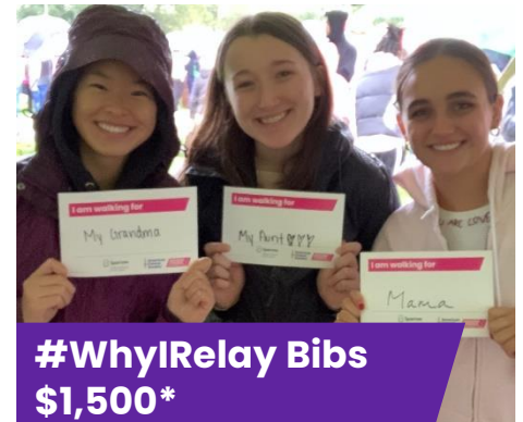
#WhyRelay Bibs $1,500*