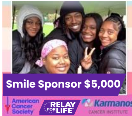
Smile Sponsor $5,000